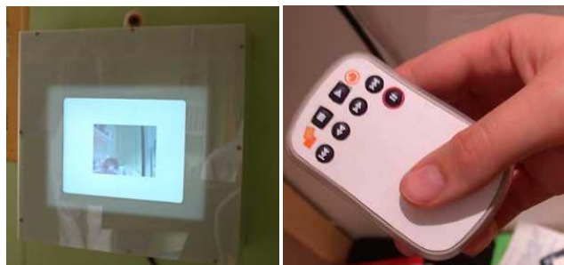
Figure 3. videoProbe (left) and customized remote control (right)

Despite problems with robustness, the probes were helpful in revealing communication patterns and technology needs and desires. Many of the messages in the U.S. family involved attempts at coordination for things like picking up children, indicating that this is a promising area of research for new technologies. In addition, the playful use of the probe by the Swedish family indicated a desire for simple, fun ways of providing remote awareness between households. The probes also revealed more subtle aspects of communication in the families that would likely not have come up in interviews - i.e. the unique communication habits of the Swedish sisters and the U.S. grandparents.