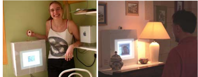
Figure 4. videoProbes in the French families' homes

To simplify the use of the videoProbe, we created a custom-made graphic design for the remote control. Our earlier tests showed that even the few tasks executed by the remote control could be confusing. It was not obvious how to put an image into or remove it from the album, and these actions are not clearly related to culturally-established VCR control iconography, such as <<, >, >>. Note that users also face these problems when attempting to manipulate stored images on commercial digital cameras.